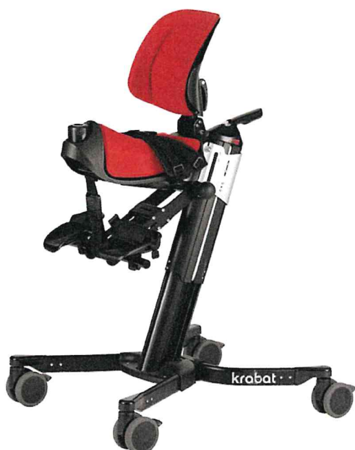
Krabat Jockey, str. 1